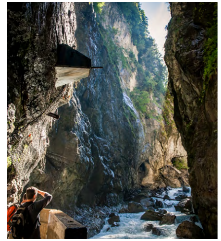
Partnach Gorge: Perfect hike activity with impressive views