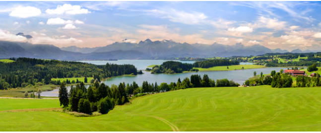
Lake Forggensee: Did you know that it's a man-made lake?