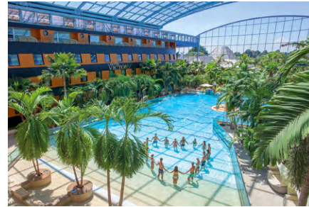
Therme Erding: Offers over 30 pools and saunas