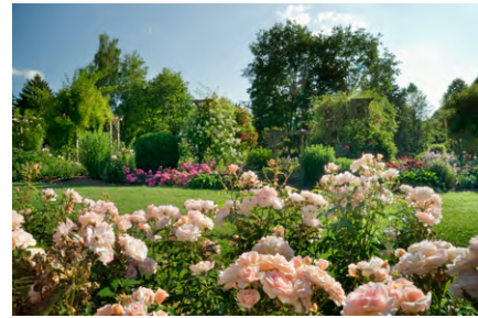
Senses: Spa Park includes a scent and aroma garden