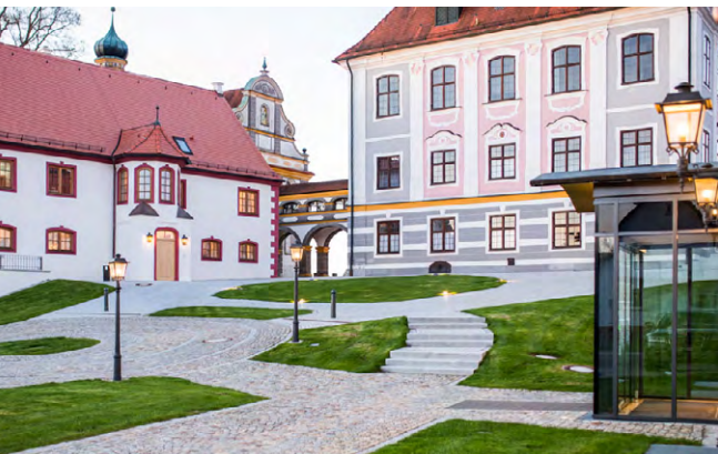
Leitheim Castle: A 4-star hotel with 49 rooms