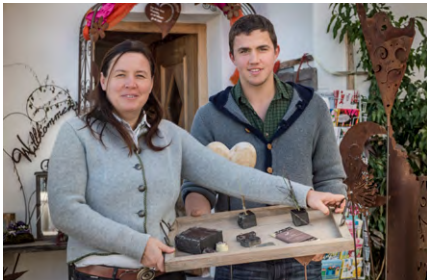
Moor soap: A treasure for body and soul