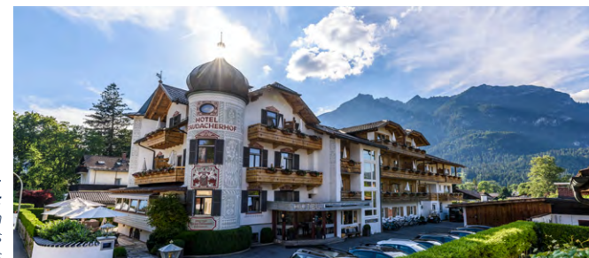
Hotel Staudacherhof: A Bavarian wellness oasis in the Alps